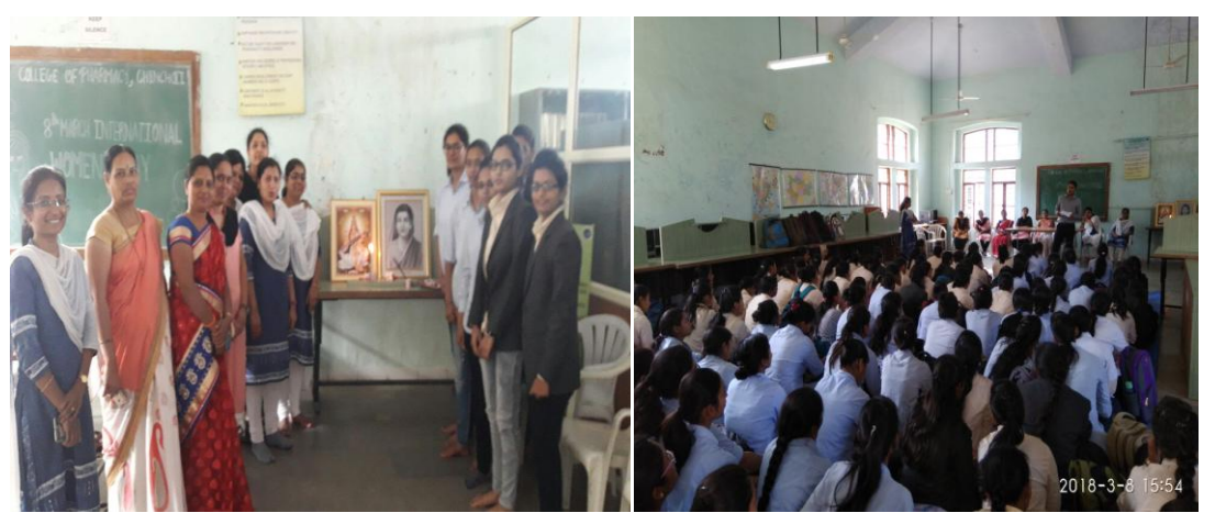
Celebration of International Women's Day on March 8, 2018