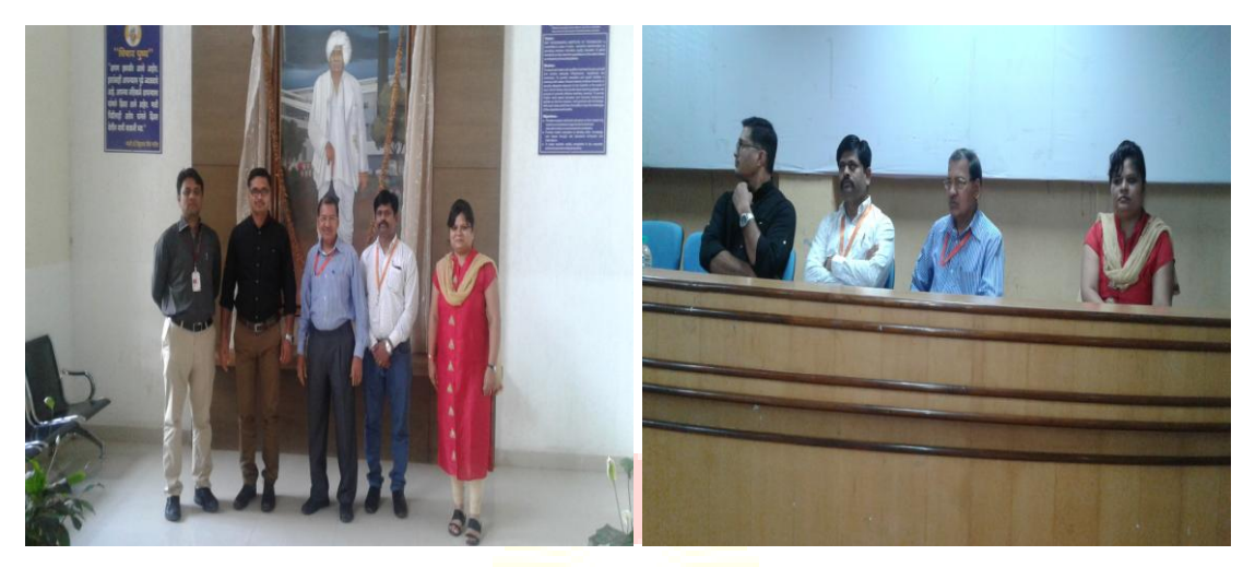
Open Campus Interview of Glaxo Smithkline Ltd., Nashik on June 2017