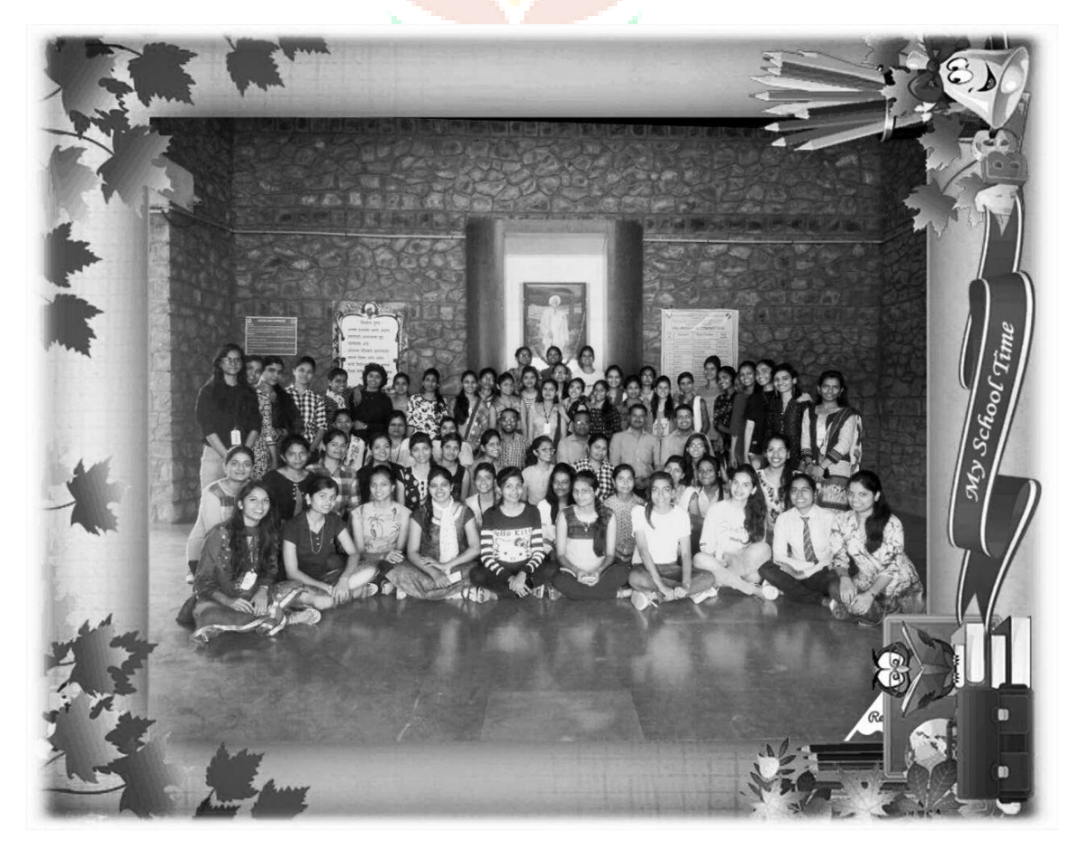
Final Year B. Pharmacy Batch 2017-18