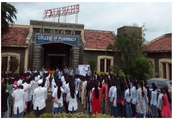
Pledge Taking Ceremony on August 2017