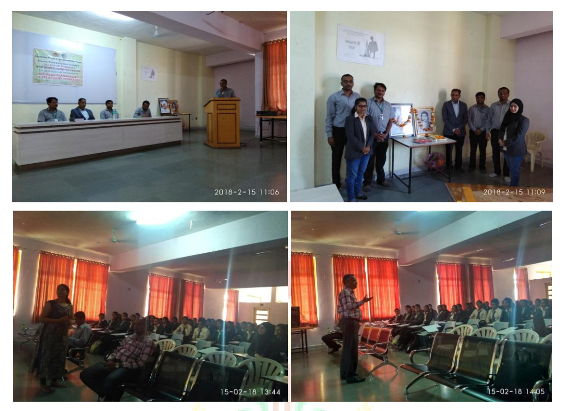
Workshop on Student Personality Development on February 15, 2018