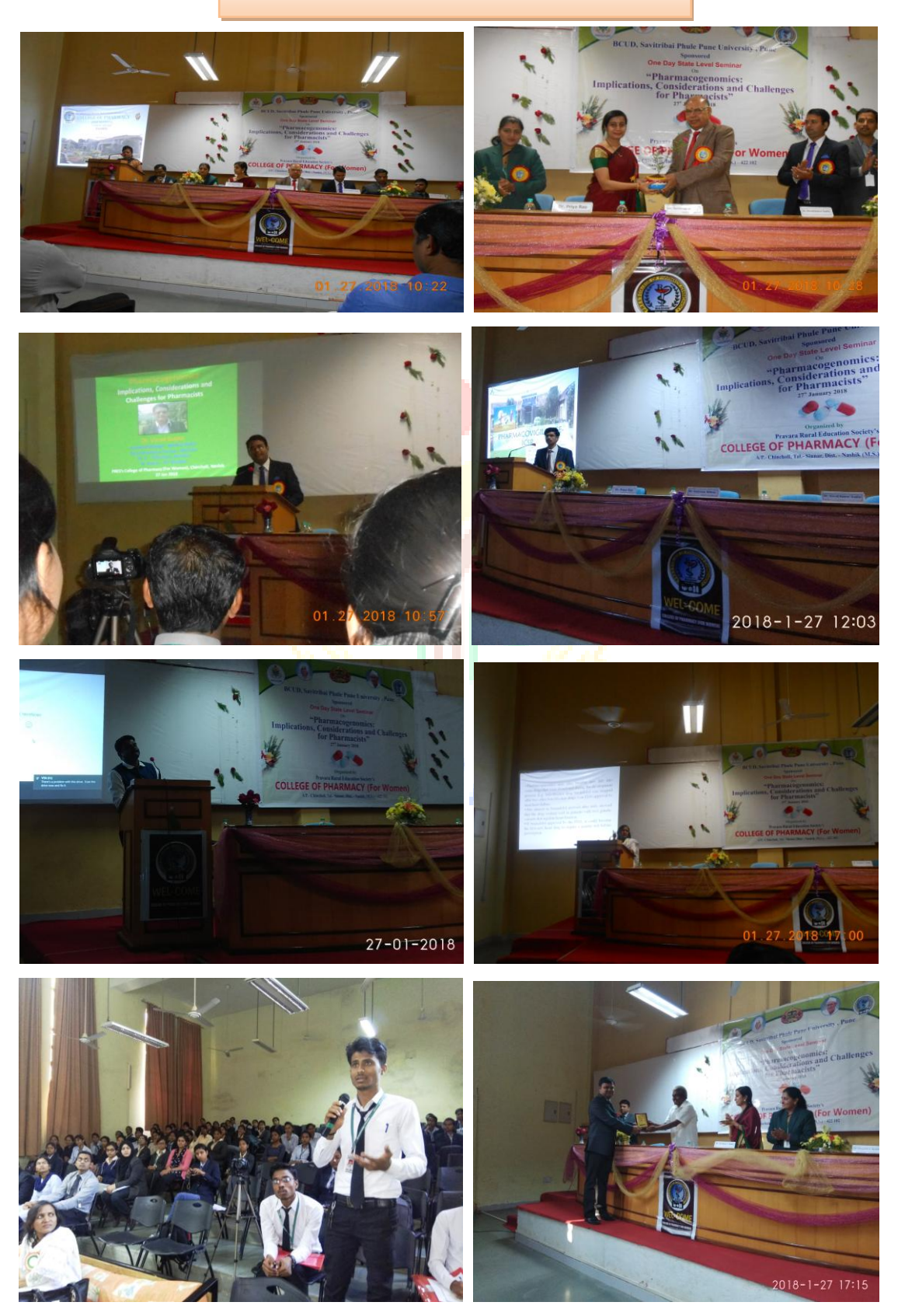
A State Level Seminar on "Pharmacogenomics: Implications, Considerations and Challenges for Pharmacists" on, January 27, 2018