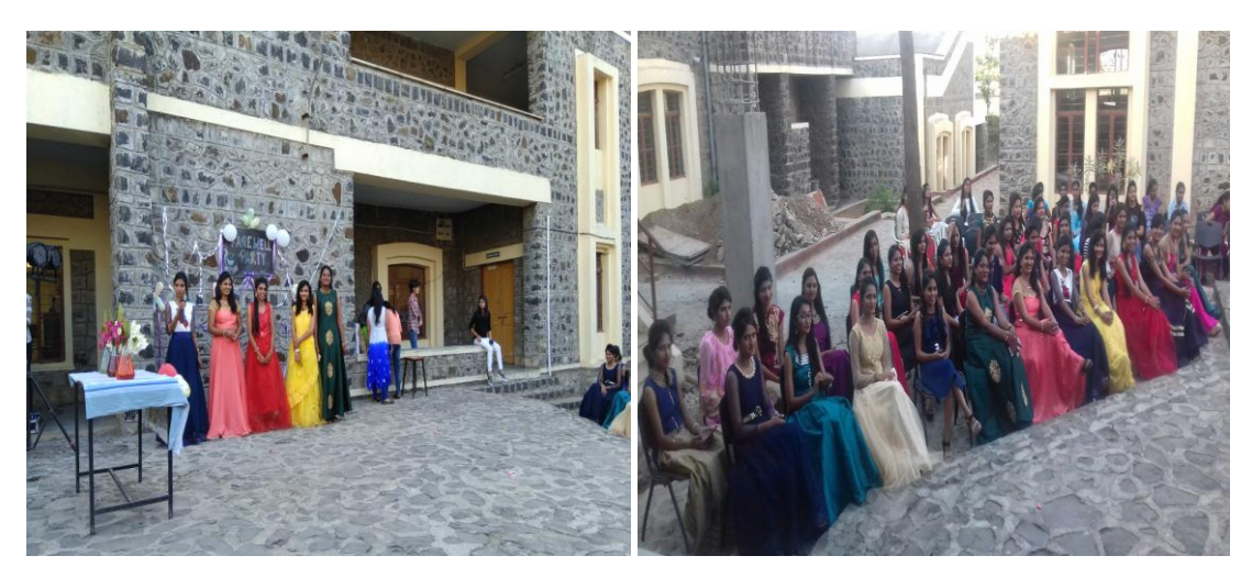
Farewell Function 2018