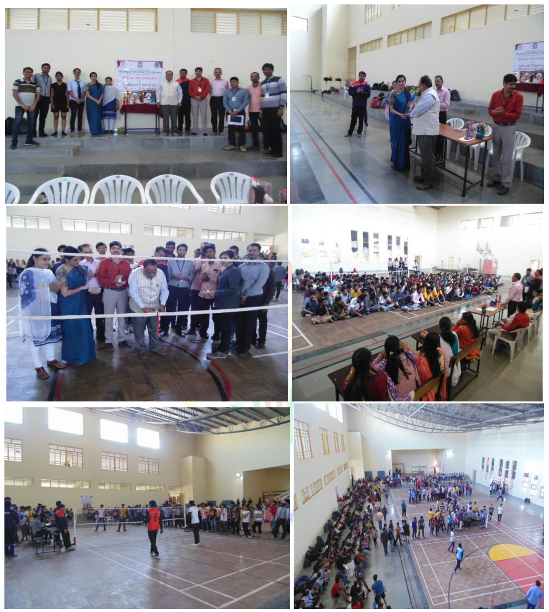
Celebration of 56th National Pharmacy Week 2018