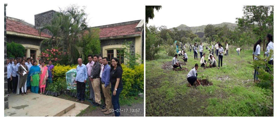
Tree Plantation Program "Van Mahostav" on 03rd July 2017