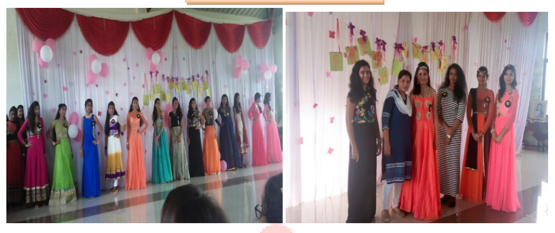
Fresher's Day- Freshobonanzza 2017