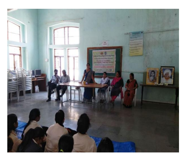
A workshop on Nirbhay Kanya Abhiyan on March 10, 2018