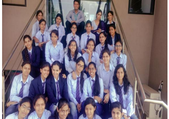
Final Year B. Pharmacy Students visited Ashwamedh Laboratories, Nashik