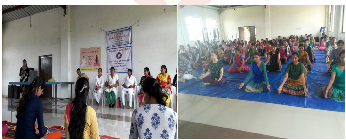
International Yoga Day Celebration