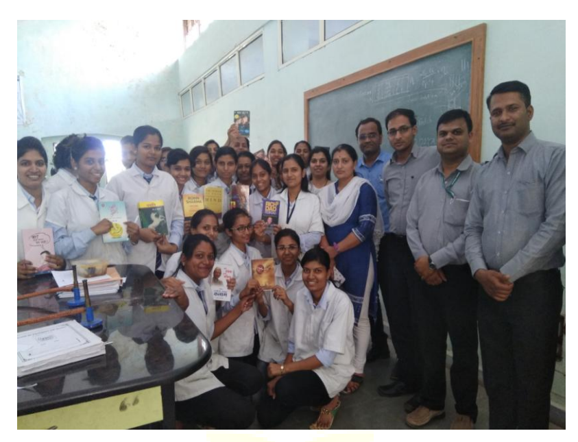
Book Donation to Kalam Centre IMB COPC Library by Final Year B. Pharmacy Students Batch 2017-18