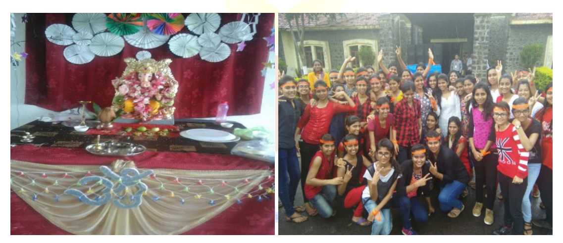
Ganesh Festival Celebration 2017