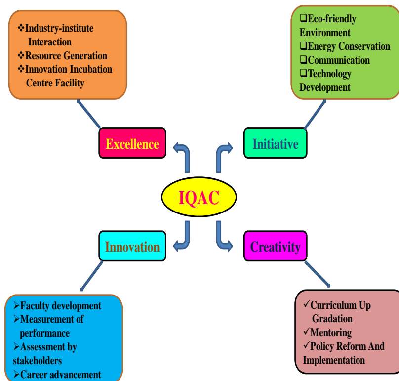
Diagram representate goals of IQAC