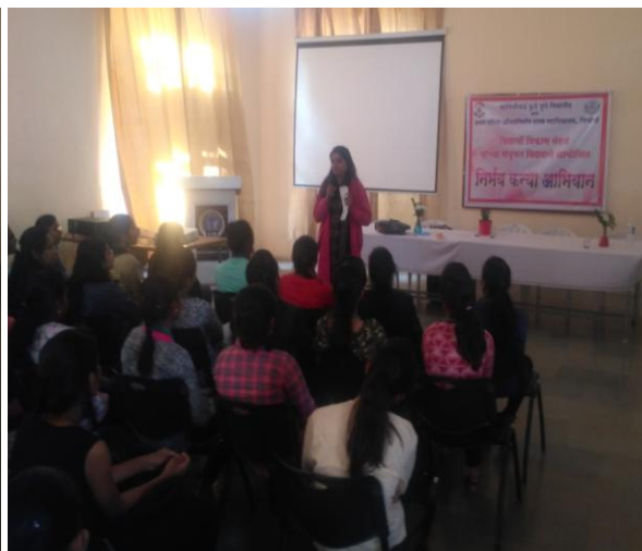
Seminar on Nirbhay Kanya Abhiyan