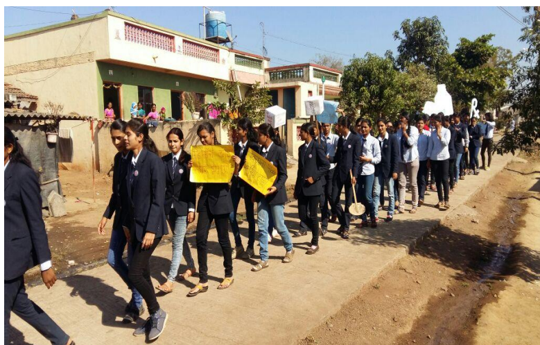
Malaria Awareness rally in the village