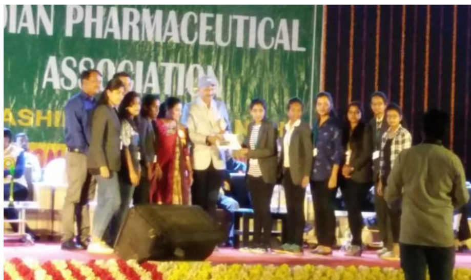
Winners of Throw Ball Competition