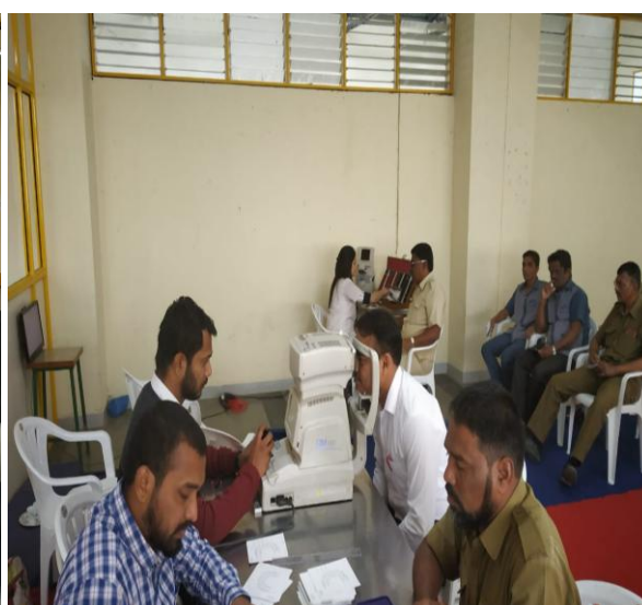
Eye Check up Camp