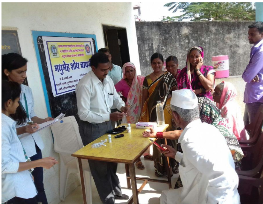
Diabetic detection Camp