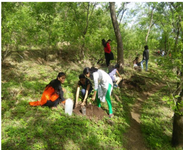
Tree plantation program with Green Revolution under College Social Responsibility (CSR) Cell at Anand Kanan, Chunchale Tekadi, MIDC Ambad, Nashik