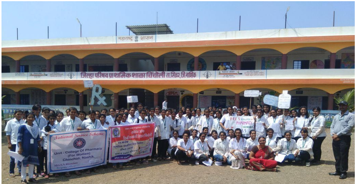
World Pharmacist day celebration at Village Chincholi in association with Sinnar Chemist Social Group