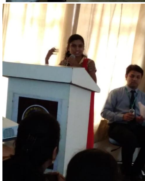
An orientation program for newly admitted first year B. Pharm