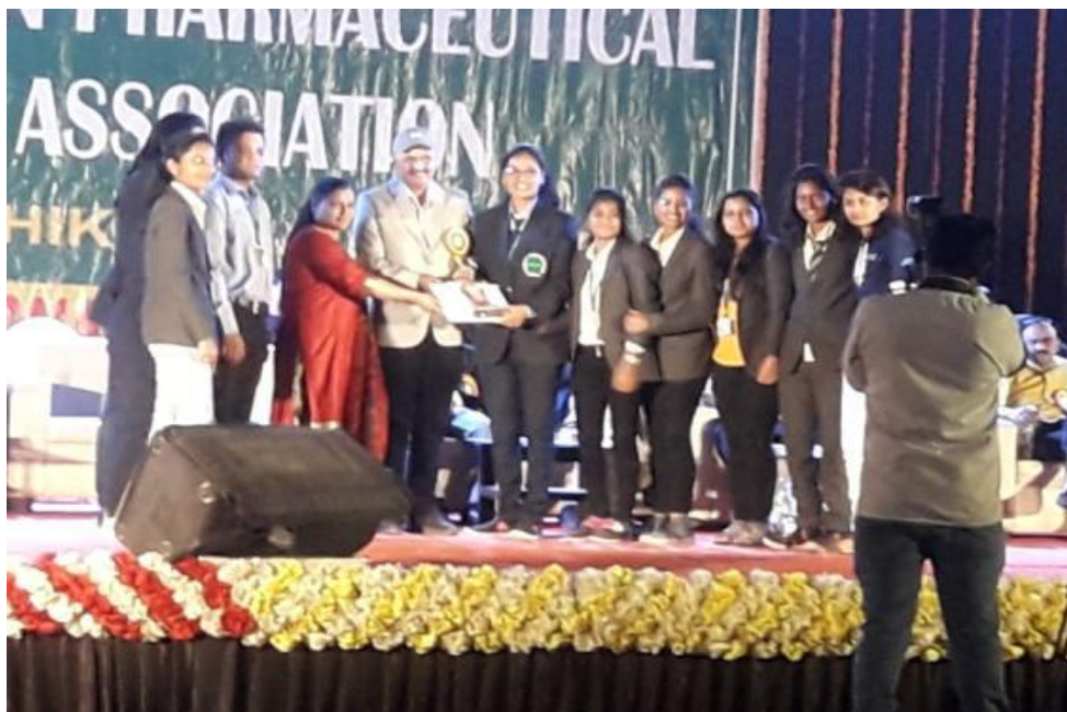
Winners of Skit Competition