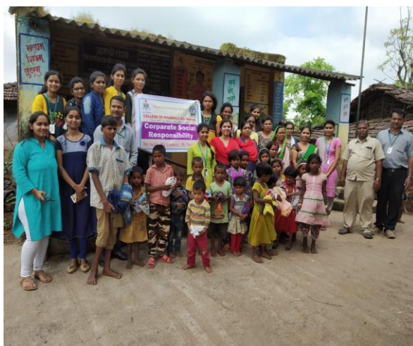
Vastra dan activity (Old clothes donation) under the CSR Activity in village of Thakurpada, near Trimbakeshwar