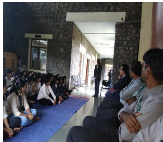
Guru Purnima Celebration