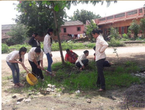
Swachh Bharat Abhiyan