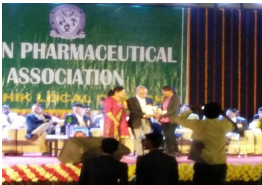
Winner of Scientific Rangoli