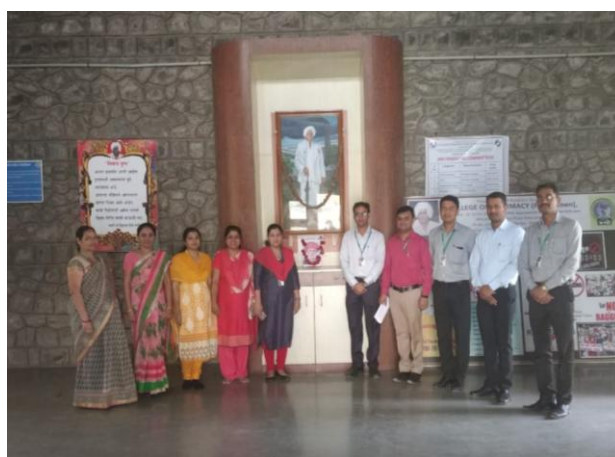
Remembering Mahatma Jyotiba Phule on Death Anniversary