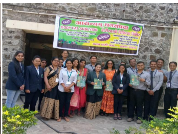
Two days Pharma Tech-Fest "Umanag2k19" with many Technical and Non-technical events