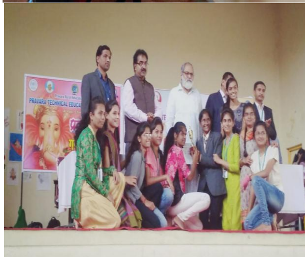
Ganesh Festival Celebration