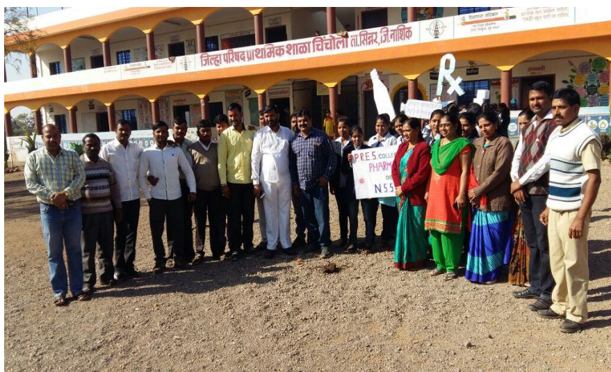
During Rally with Chincholi Grampanchayat Representative