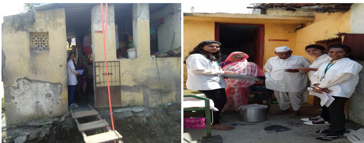
Counseling of residential people of Chincholi village regarding effective use of medicine