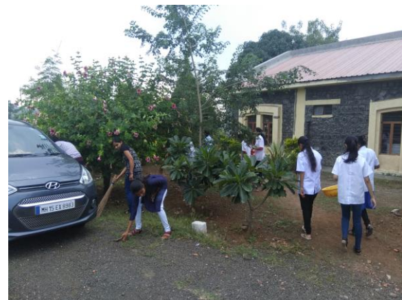
Cleanliness Drive under Swachh Bharat Abhiyaan Programme on the occasion of Mahatma Gandhi Jayanti