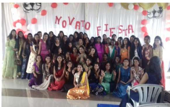
Fresher's Day Celebration