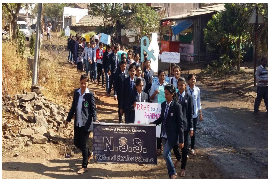
AIDS Awareness rally at Chincholi Village