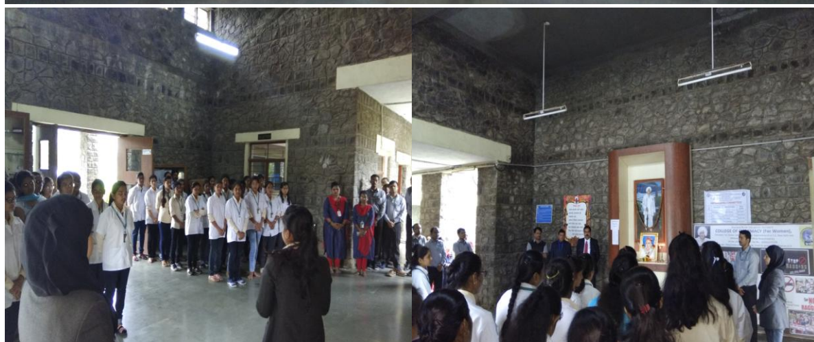
Celebration of Birth Anniversary of Lokmanya Tilak