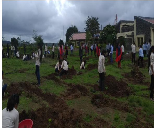
Van Mahostav Celebration