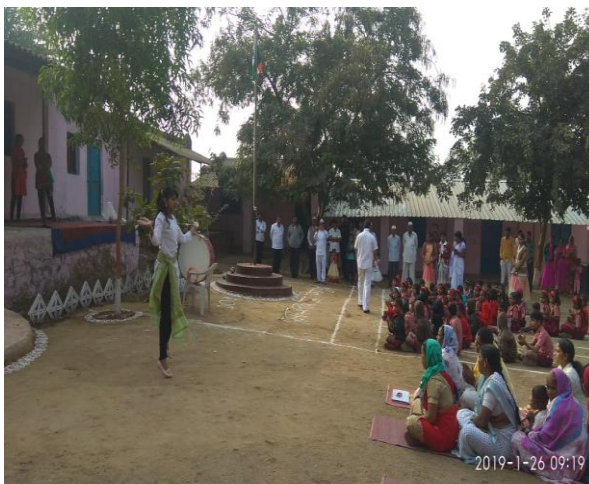
A Skit on "Tobacco Mukti Abhiyaan" on the occasion of Republic Day at Jaygaon, Sinnar under CSR Activity