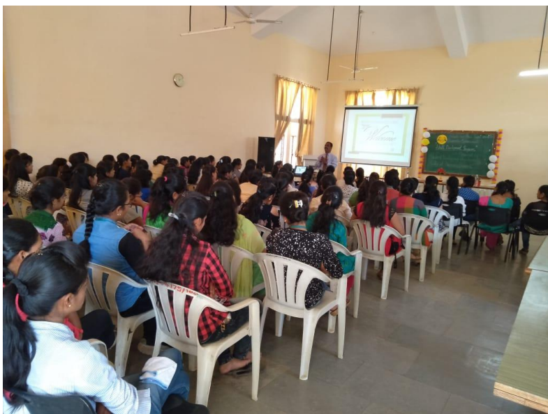
Expert lecture on Importance of soft skill on over all personality