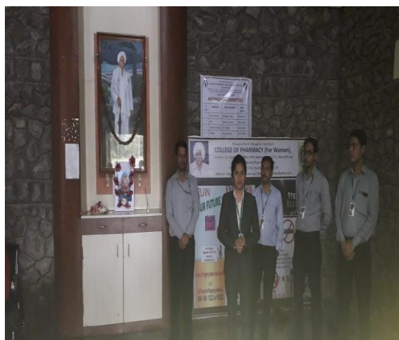
Tribute to Former Prime Minister Atal Bihari Vajpayeeji