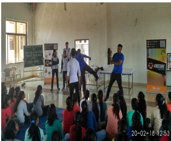
Training Session on Self Defecne by from team of Kreedak Sports, Nashik