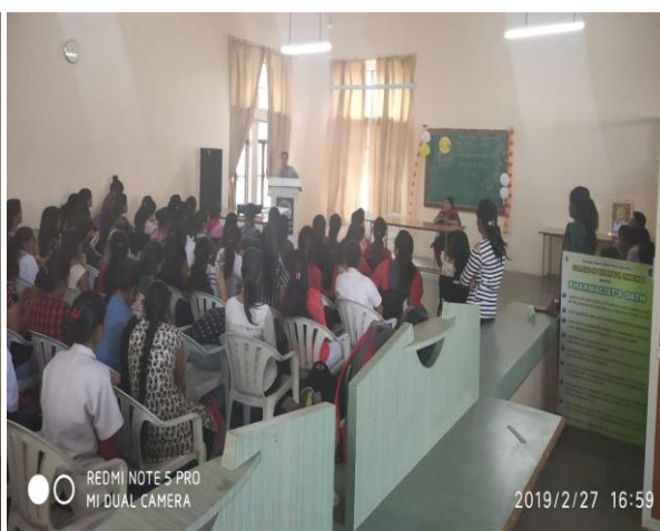
Celebration of "Marathi Bhasha Gaurav" Din