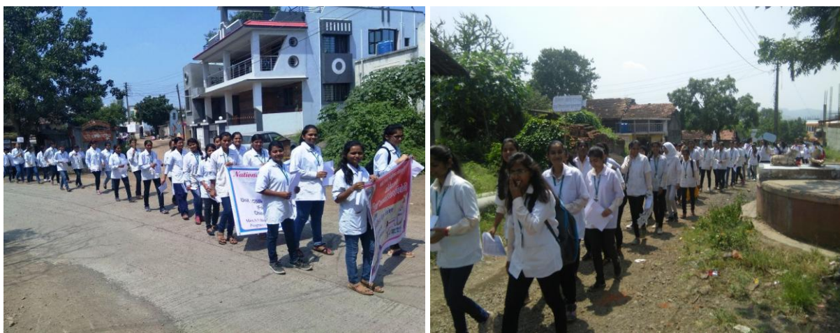
Rally at Chincholi Village having theme "Aushadhe Saksharta Abhiyan"