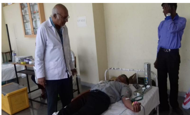
Blood Donation Camp in Association with Pravara Medical Trust, Loni