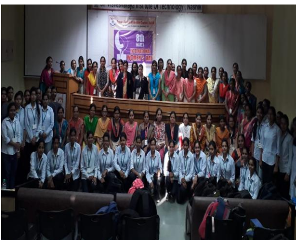
International Women's Day Celebration under the theme of "Think Equal, Build Smart and Innovative for Change"