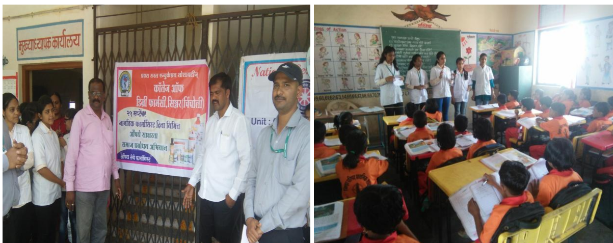
Guidance to School children regarding safe use of Medicine and Healthy life