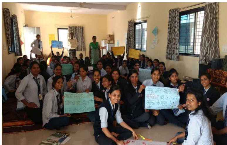
Preparation of boards for Rally