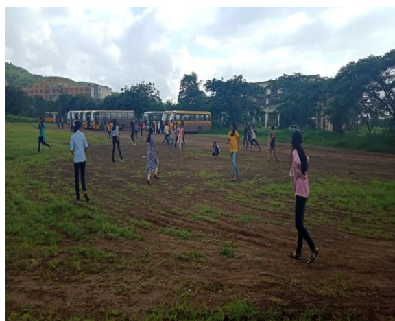
National Sports Day Celebration