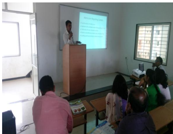
Technical Session at different Location of Sinnar and Nashik