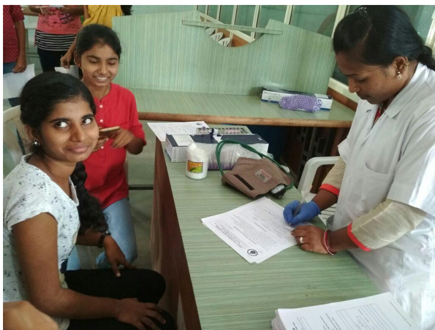
Thalassemia detection camp