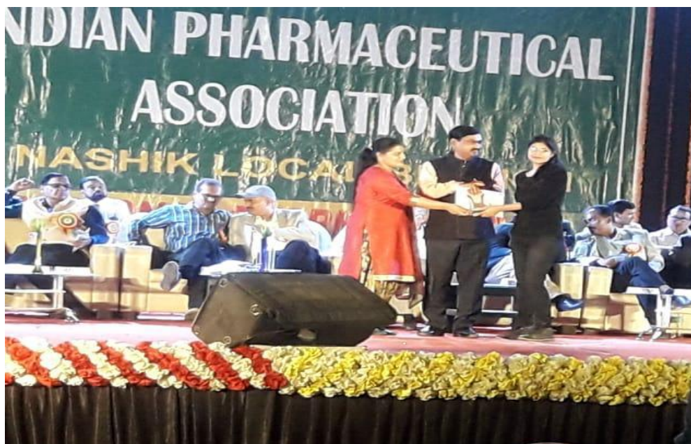
Winner of Solo Dance Competition