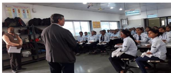
Photo with Directors of the company