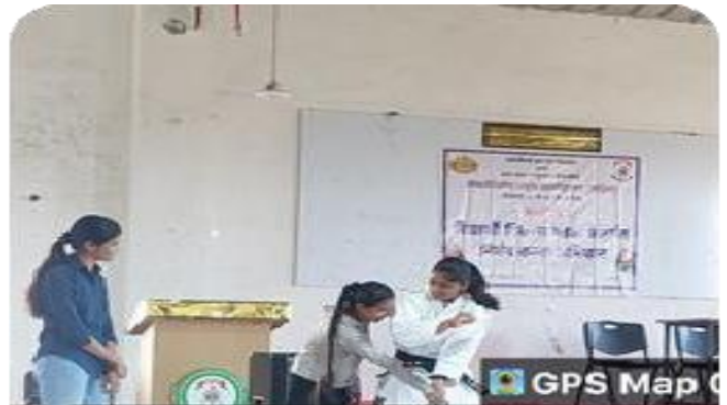
Nashik, Maharashtra, India Pravara Rural Education Society's College of Pharmacy Women's) Chincholi, Maharashtra 422102, India Lat 19.881651° Long 73.933909° 15/02/23 10:00 AM GMT +05:30