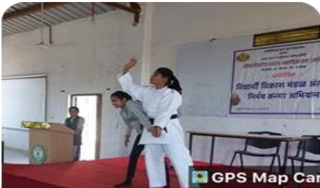
Nashik, Maharashtra, India Pravara Rural Education Society's College of Pharmacy Women's) Chincholi, Maharashtra 422102, India Lat 19.881651° Long 73.933909° 15/02/23 10:03 AM GMT +05:30