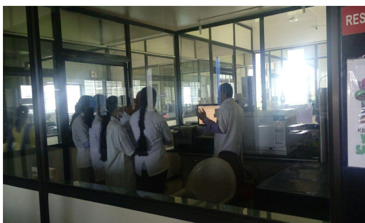
Final Year B. Pharmacy Students visited Ashwamedh Laboratories, Nashik