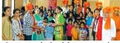
नाशिक : आधाराश्रमात सोमवारी वस्तू भेट देताना मराठा साम्राज्य ग्रुपचे सदस्य.

बडगाळी, ता. २० : चिंचोली (ता. सिन्नर) येथील वैद्यकीय महाविद्यालयाच्या मराठा साम्राज्य ग्रुप मुली व मुलं तर्फे शिवजयंतीनिमित्त नाशिक आधाराश्रमातील विद्यार्थ्यांना विविध वस्तू भेट दिल्या. मराठा साम्राज्य ग्रुपमध्ये सिन्नर तालुक्यातील मुलांचा समावेश आहे. त्यांनी गावपातळीपर्यंत अत्यंत साधेपणाने शिवजयंती साजरी व्हावी, याचा पायंडा पडण्यासाठी अनाथ मुलांना वस्तू भेट दिल्या. शिवजयंतीनिमित्त डोळे, फटाक्यांचा खर्च वाचून तो अनाथांना दर वर्षी खर्च करण्याचा