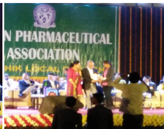
Winner of Scientific Rangoli

Winners of the 57 th National Pharmacy Week 2018-2019