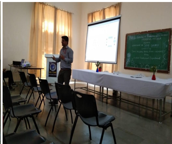
Workshop on Save Energy on February 4, 2019