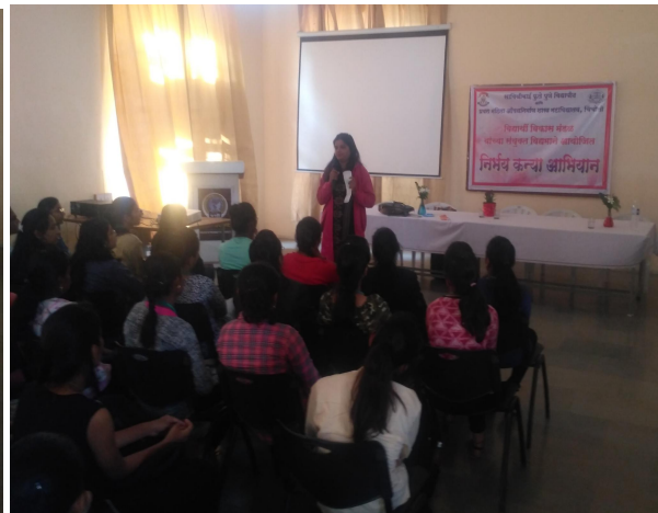
Seminar on Nirbhay Kanya Abhiyan on February 6, 2019