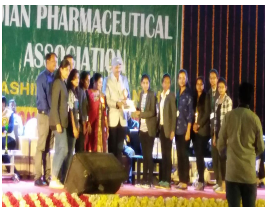
Winners of Throw Ball Competition