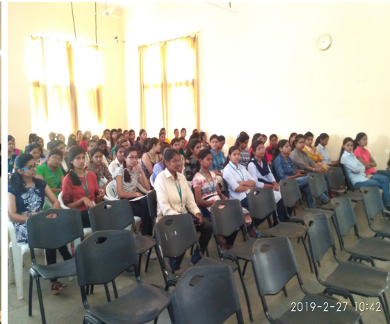
A Workshop on Skill Development Program on 27 February 2019