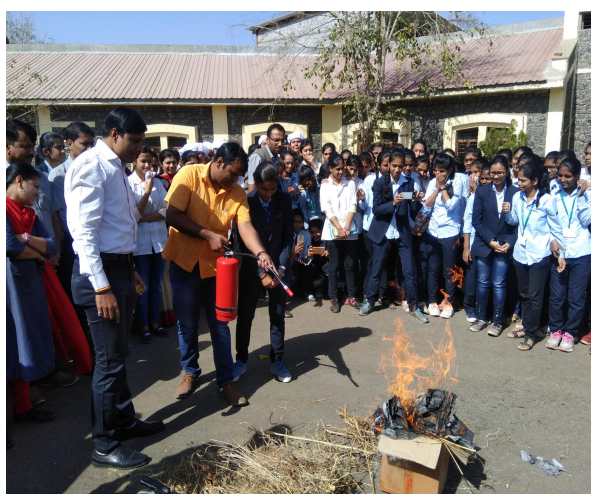
Workshop on Disaster Management on February 6, 2019