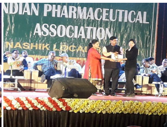
Winner of Solo Dance Competition