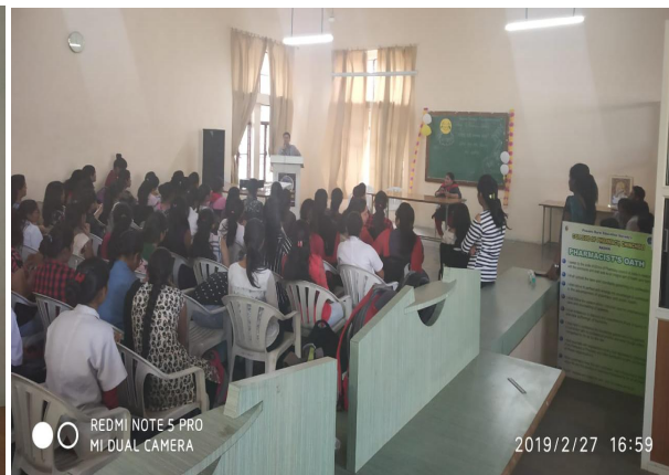
Celebration of “Marathi Bhasha Gaurav” Din on February 27, 2019