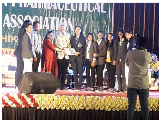
Winners of Skit Competition